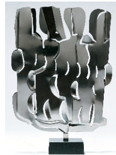
Rotating by Pietro Consagra