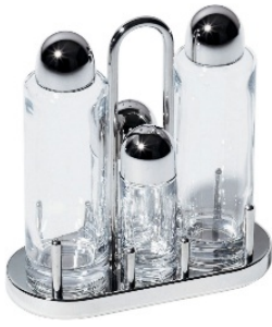
5070 oil cruets by Ettore Sottsass (Program 5)