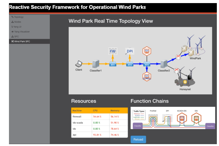
Fig. 2. Graphical User Interface for real-time monitoring of the operation of the Reactive Security Framework on the ODL Controller

1) SFC Manager: In more detail, the SFC Manager controller module exposes a number of interfaces that various components can use to provide and receive information about service chains that need to be built, which tenants want to use them, which destinations are being accessed, what applications