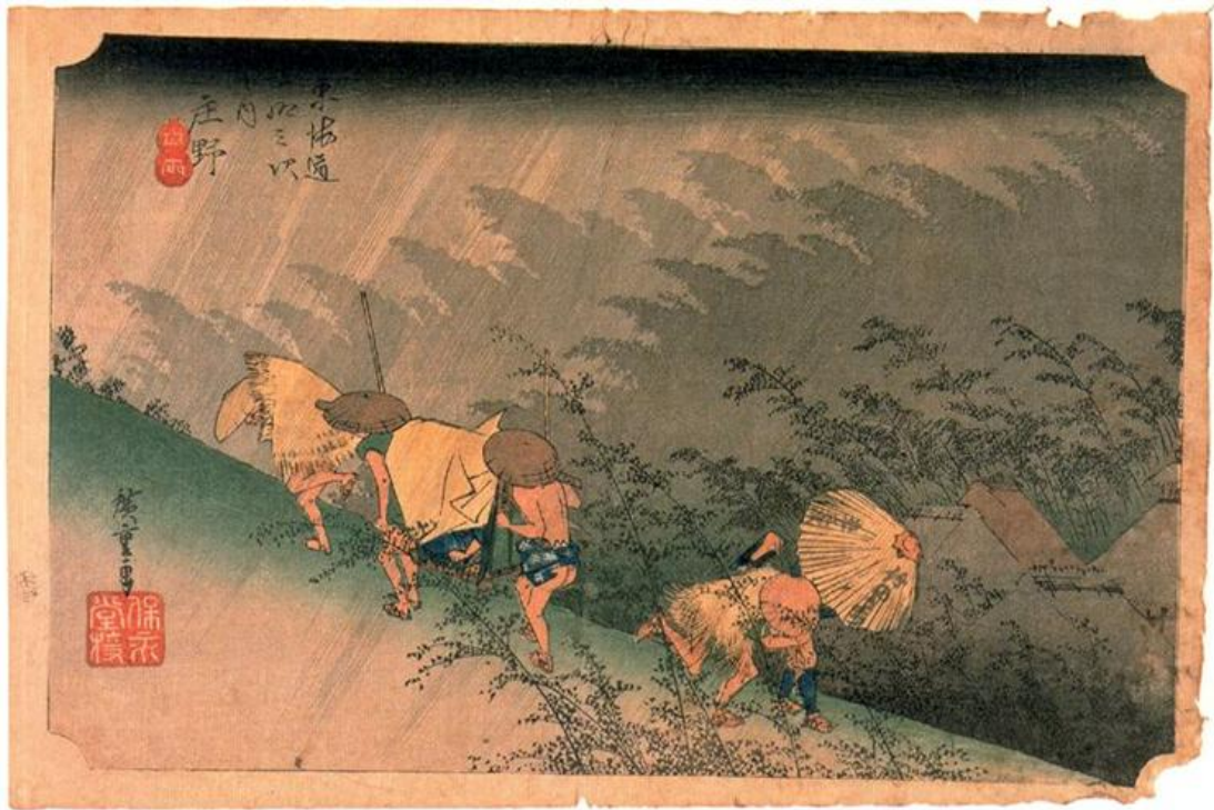
Hiroshige, White Rain, Shono (1833-34)

The final piece in the programme, Free Setting , is more straightforward, a rampageous piece written for the Siobhan Davies Dance Company (one of the various companies or dancers with whom Finnissy worked regularly). Cutting between quite metrically fixed dance material generally remaining quite close in tessitura, a more transparent writing in the outer registers, and two passages of syncopated lines accompanied by more periodic (but metrically irregular) lines and ‘punctuation’, as well as some intercutting of long sustained pitches (added to the revised version), the piece is relatively characteristic of his virtuoso idiom of the period.