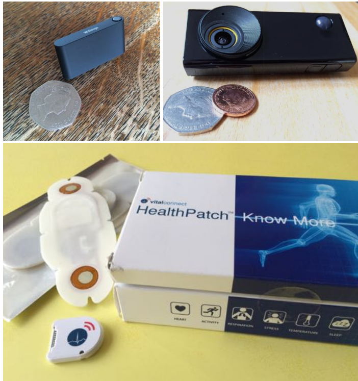
Figure 2. Withings “Pulse O2” activity tracker (a), the “Autographer” (b), and Vital Connects “HealthPatch” biosensor kit (c).

My journey—equipped with sensors—is an intentional move to the edges of London’s bike rental docking stations and the associated data trails of bike flows. The cynically inclined would see the two docking stations at each end of my route as needed to fill the void between the glass clad, elegant office blocks and high-rise apartment towers of Canary Wharf (to the South) and the heavily invested Stratford City (to the North). Both docking stations are in an area much like South East London that has so far not been on any plans to extend the bike rental scheme. During my 45 minute journey no activity is recorded at the Aberfeldy Street docking station while a total of 1,810 were completed across the network. In the week preceding my journey 18 journeys began from Aberfeldy Street against a seven day total of 139,793 for the entire scheme. So the numbers show Aberfeldy Street’s docking station to be at the quiet periphery of the rental scheme. Indeed, it’s hard not to wonder how decisions are made about docking station locations and why out of the ways streets like Aberfeldy Street have them installed.