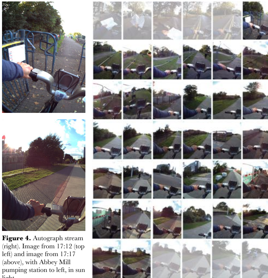
Figure 4. Autograph stream (right). Image from 17:12 (top left) and image from 17:17 (above), with Abbey Mill pumping station to left, in sun light.

Overlaying these data onto other kinds of data, this time geo-spatial, weaves yet longer unconnected/connected strands into this small window of time and space. Again, at 17:12, my ride intersects with an embankment running over the 150 year old Northern Outfall Sewer, part of London's network of Victorian sewage systems (Lat 51° 31' 39.4435"N, Long 0° 1' 2.2544"E). Here, I move from the road to The Greenway , a raised foot and cycle path running about 7km over sewage pipes and outlets between Bow and Beckton. Riding westward at 17:17 (as my momentary window falls away) and still on the Greenway, I catch site of and find myself immediately North of the Abbey Mills pumping station (51°31'53.6"N 0°00'04.6"W), another still operating monument to London's Victorian waterworks infrastructure (Fig. 4).