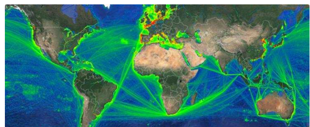
Figure 1: Worldwide AIS positions acquired by satellites (ORBCOMM)

©2017, Copyright is with the authors. Published in Proc. 20 th International Conference on Extending Database Technology (EDBT), March 21-24, 2017 - Venice, Italy: ISBN 978-3-89318-073-8, on OpenProceedings.org. Distribution of this paper is permitted under the terms of the Creative Common License CC-by-nc-nd 4.0.