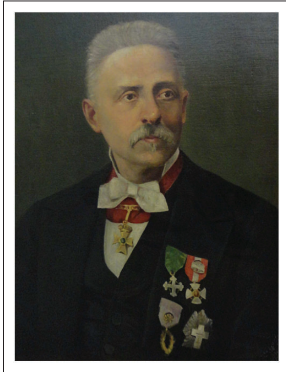
Figure 1. Reproduction of an oil painting of Ragona-Scinà (Chinnici, 2013).

with multi-field tachistoscopes. These were popular in vision research from about 1910 to about the 1970s when they were largely supplanted by oscilloscopes and then computer monitors (Wade & Heller, 1997).