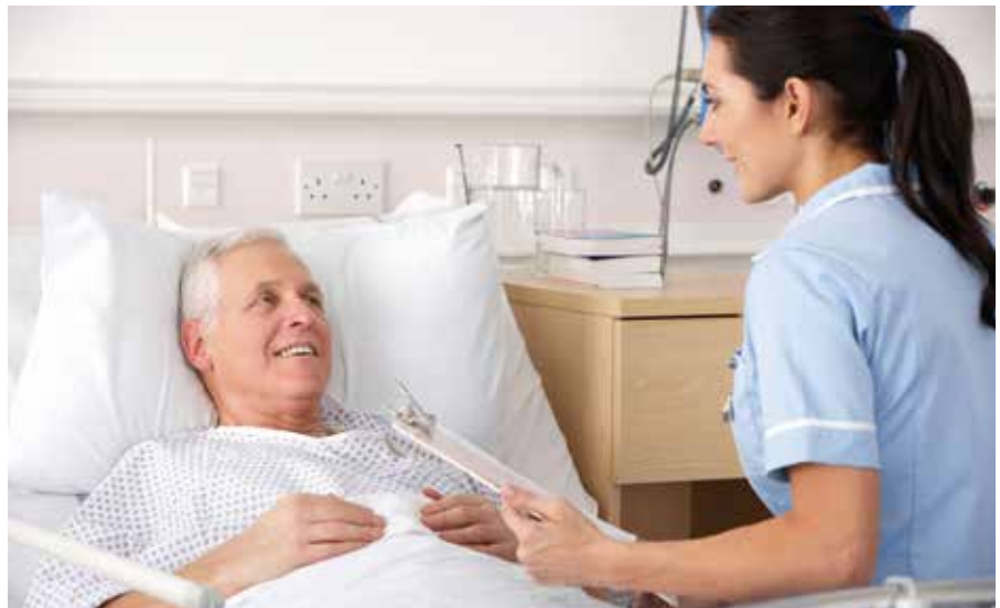
The new nursing associate role is intended to complement the work of registered nurses

Including service users in service development is established best practice in the NHS. The articles included in the literature review recognise that there is value in engaging with patients in the process of identifying need, including gaps in service provision (South et al, 2007; James et al, 2006) – however, they fall short of outlining a role for patients in the design of new healthcare roles.