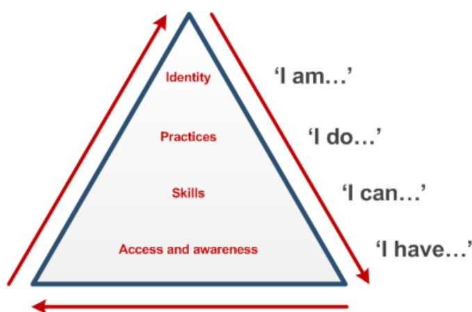
Figure 1: Beetham and Sharp's model of digital literacies 2010.

The term 'digital literacy' has been used in the higher education sector for a number of years. In 2010 Beetham and Sharp's model of digital literacy was adopted by Jisc (see Figure 1) who went on to develop first seven and then later six elements of digital literacy (Jisc, 2017).