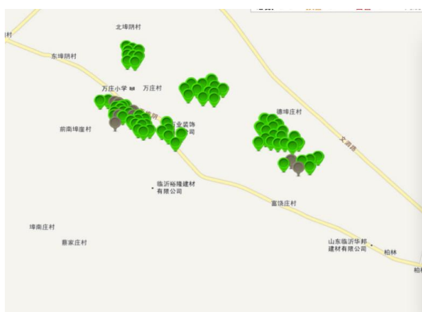
Figure 2. Schematic diagram of the layout of the goaves in the 13 gypsum mines considered