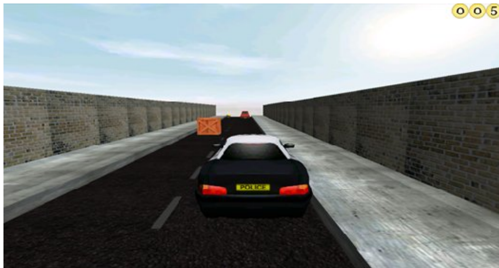
Figure 1: Illustration of the ongoing task