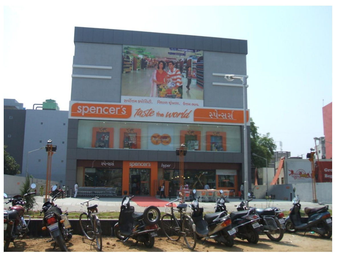
Figure 4.1: A sign above the hypermarket reads in English and Gujarati 'Taste the World', beside a photograph of a young couple shopping for groceries together.

The media in particular popularises this image of the new modern Indian middle class. Marketing firms have targeted the middle classes through images of a hyper consumerist cosmopolitan lifestyle, associating 'modern' with the possession and accumulation of consumer goods (Appadurai and Breckenridge 1995; Oza 2001). For example, while I was in Baroda the first 'hypermarket' opened. Over the store name a large photo showed a young couple shopping together in the market with the words 'Taste the World' written above in English and Gujarati (see Figure 4.1). Here the hypermarket appeals to the image of a young prosperous couple, shopping together seemingly as a past time, the tag line inferring the cosmopolitan nature of this project.