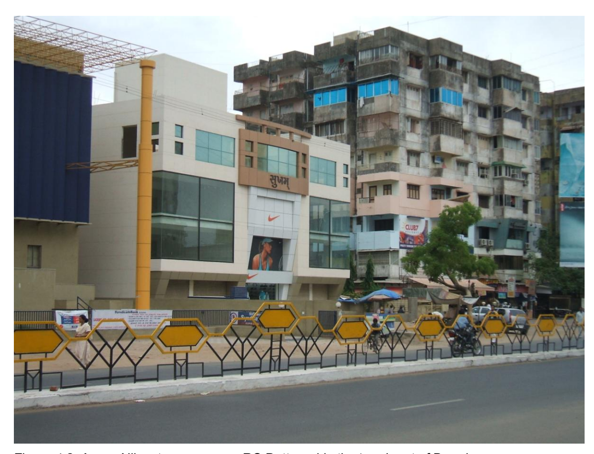
Figure 4.2: A new Nike store opens on RC Dutt road in the 'new' part of Baroda