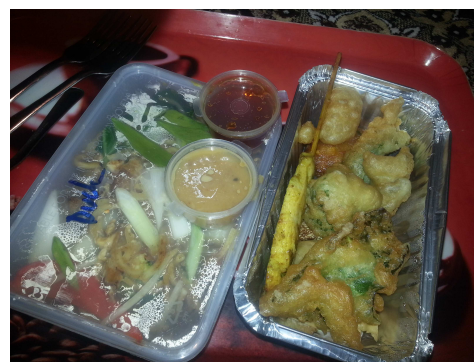
Figure 4. Naira captured an image of a Thai takeaway. The image assisted in the understanding of the impact the type of food had on blood glucose levels and insulin requirements.

Participants are engaging in capture, following the criteria laid out by Brown et al. [4]; to archive, to collect and collate,