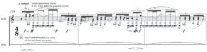
Figure 7: excerpt from Resistance , mm. 174–76

recording and post-processing, through the audio ripped from YouTube, through the miniature loudspeaker in the bass clarinet, blended with the live sound of the instrumentalist and her voice, through a layer of foil, through an additional microphone for amplification, and diffused out of full-range speakers to the listener.