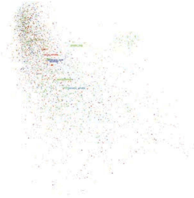
Figure 3: Screenshot from CataRT showing vocal samples plotted by spectral centroid (horizontal axis) and spectral flatness (vertical axis). Colors and labels correspond to vocal preparation materials