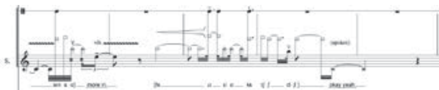
Figure 4: excerpt from Without Words , soprano part, mm. 65–69

The other intelligible words, “okay yeah,” were ad-libbed by DeBoer Bartlett during the recording session—a trace of the process of collaboration between composer and performer. This “noise” of the sampling procedure, usually edited out, is instead combined in the database on an equal footing with the more literary texts, calling to mind the information theory concept of noise as unwanted signal.