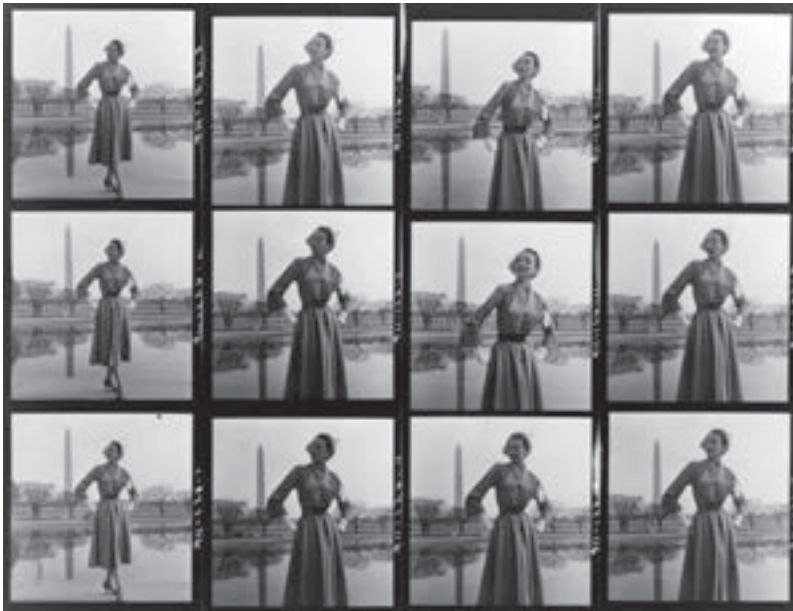
Figure 2: Toni Frissell, contact sheet, “Fashion model posing near Tidal Basin with Washington Monument in background,” 1946 23

Other serial or algorithmic techniques, like those used by Brian Ferneyhough, generate a saturation of available materials. The composer is engaged constantly as a listener evaluating, discarding, or incorporating the results, like a photographer examining images in a contact sheet to select the final print. Or in the “saturation” music of composers like Franck Bedrossian, the listener is engaged as a creator, making his or her own selection from the tangled surface.