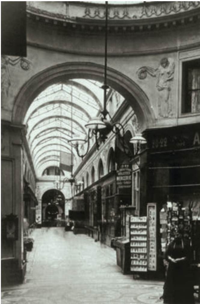
Figure 5: Galerie Vivienne, photographed in 1905 (public domain)

“improvisers” as well as over a century of time that has left some arcades filled with fashionable shops while others are repurposed or nearly abandoned. Benjamin’s Arcades Project remains unfinished, as if the strain of pre-digital recopying and rearranging was too much to handle in a work that can be read as a prototype of the hyperlink.