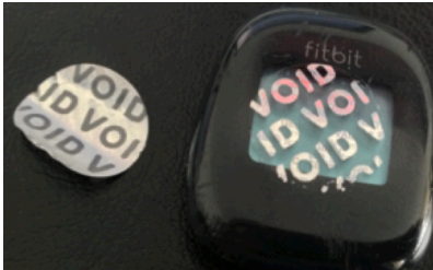
Figure 2: The Fitbit Zip activity tracker, showing a removed tamper-evident sticker. The sticker was applied to all devices used in groups 1 and 2, immediately after set-up. Each sticker was printed with the participant number to prevent participants replacing the sticker.

each year are caused by physical inactivity [7]. In addition obesity, which is strongly linked to physical inactivity, is a strong risk factor for many chronic diseases [5]. Physical activity policies and guidelines exist in many countries and are often accompanied with educational advertising campaigns aimed at increasing activity. These campaigns may be successful in increasing awareness, but many people struggle to meet recommendations [3].