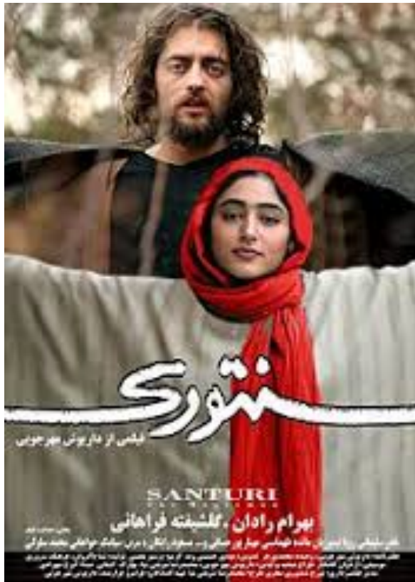
Santoori (Santoor Player, Dariush Mehrjui, 2007)