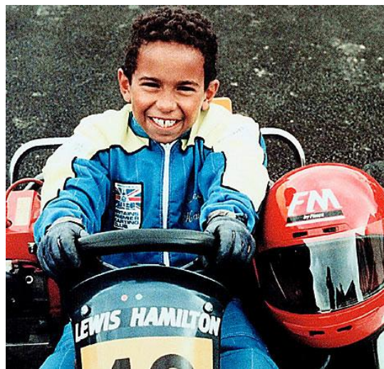
Figure 1. Lewis Hamilton started racing as a young child.