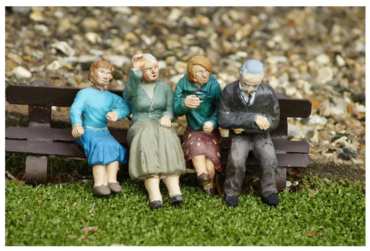
A new model for pensions?

Doubling a tax rate does not double the amount of revenue a government collects. The distortions and disincentives the tax creates suppress economic activity at an ever increasing rate, shrinking the tax base. Beyond a certain point a debt becomes unsustainable, when taxes can no longer rise enough to service debt interest payments. Though the UK and other western countries may still be far from this Greek scenario, they will suffer, particularly once interest rates begin to rise and refinancing the debt being accumulated becomes more difficult.