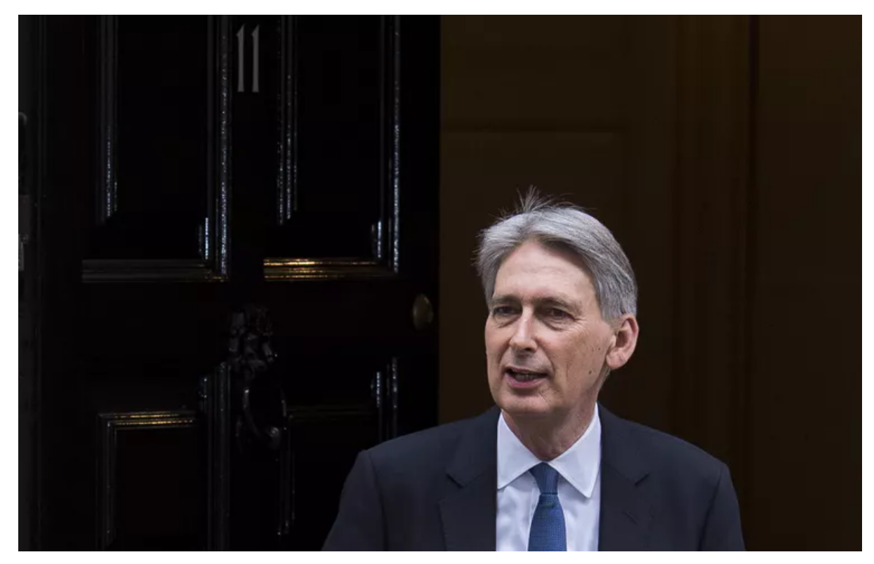
Hammond is trying a different route.

(those that contribute most to the party in government) in areas of the country most in need of investment (marginal constituencies).