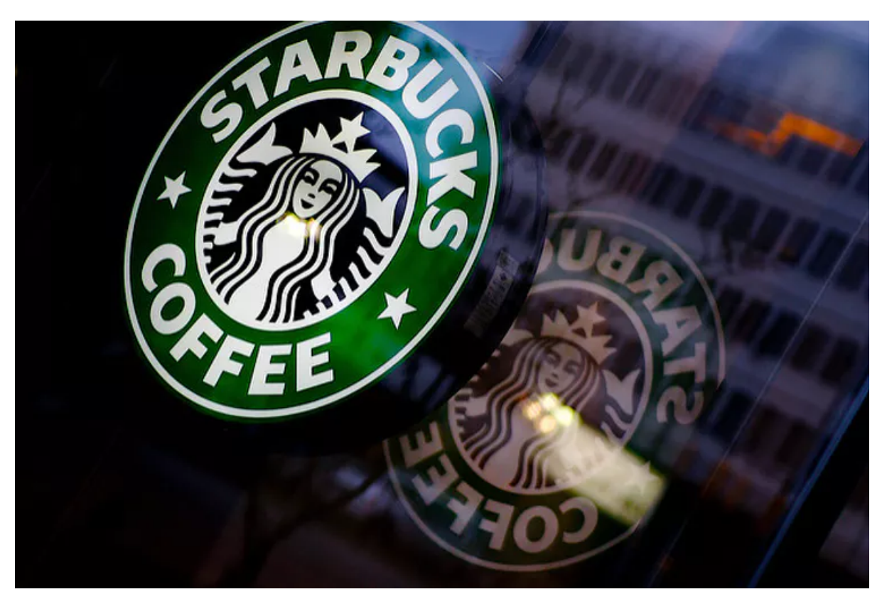
Reflecting on new tax arrangements for business.

Personally, I am not bothered that Amazon or Starbucks do not "pay their fair share". Indeed, I believe they have a fiduciary responsibility to their shareholders to pay only what the law requires and not a penny more. Demanding they do otherwise is an assault on the very concept of the rule of law and seems vaguely fascistic.