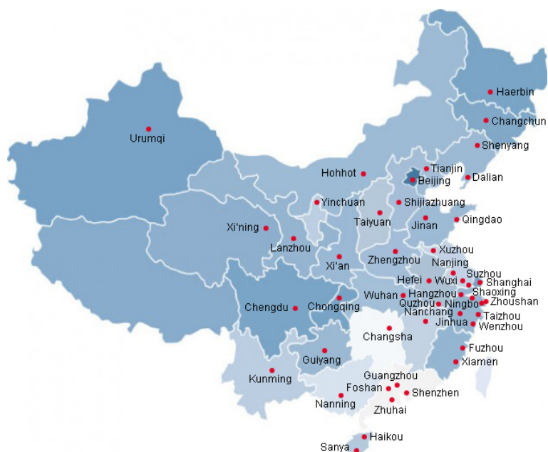
Fig 2 Locations of Restricted Cities