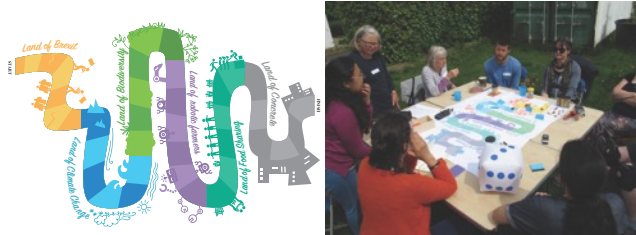
Figure 4: Board game design (left), participants playing the game (right), designed deck of opportunity or problem cards depicted by insects and animals related to food growing (below)

participants rolled a dice and moved across the board crossing various lands and discussing visions of future food growing within these lands. The players also had to select a card from a deck that we designed to represent constraints on or opportunities for the future. These visions gave rise to discussions of suggested future scenarios, their probability and impacts. Key discussion points were captured on the board through post-it notes. Six participants took part in Workshop 3.