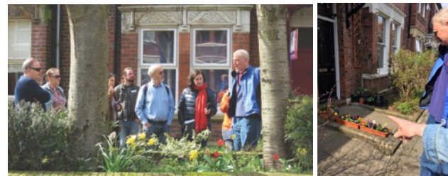
Figure 3: Walking through back lanes and streets