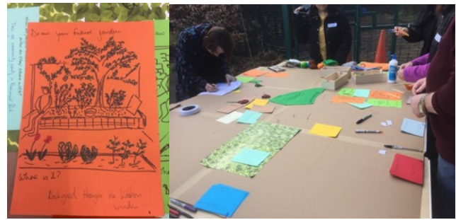
Figure 2: Drawing of a future garden (left), and participants populating the neighbourhood map (right) with cards.

Eight participants took part in the first workshop. We drew on traditions of participatory mapping from action research [7] asking participants to map their existing and future gardens, and other growing spaces in the area, onto a large rough map of the neighbourhood, which we prepared in advance by drawing the main geographical boundaries and landmarks on a large piece of blank paper. Within the mapping exercise we were looking to capture individual and community understanding of food growing, and issues around participation and belonging in the area. We asked people to populate the map by writing or drawing on the provided cards with prompts such as “How do people share food in the area?”, “What food would you like to grow in the future?” “Draw your garden and where it is located?” and “Draw your future garden”. We provided a large selection of arts and crafts materials that participants could use to complete the tasks. The exercise encouraged the participants to draw, paste, build and convert the map into a layered artefact of histories and future trajectories for the area under discussion.