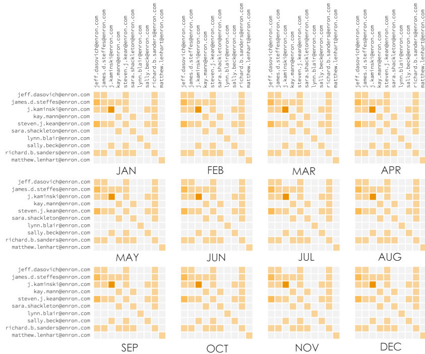
Fig. 1. Small Multiples Matrix-based Diagram representing Enron company's individuals email relationships