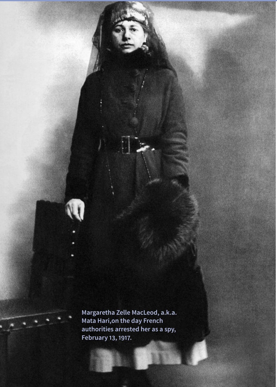
Margaretha Zelle MacLeod, a.k.a. Mata Hari, on the day French authorities arrested her as a spy, February 13, 1917.