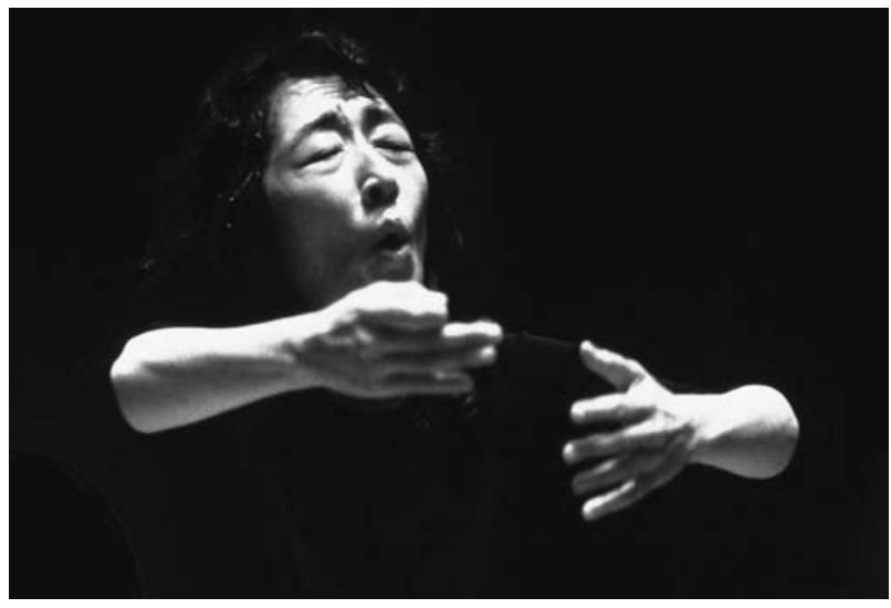
Figure 2 Mitsuko Uchida.

In some of these images it is as if the conductors themselves take on the appearance of imagined spirits, all but disembodied, with only their most salient features evident. Principal among these is the highly symbolic baton – itself possibly related subliminally to the wizard's wand in the collective mind of the audience – and the hands that are so prominent in the performance of the dance. The face is also important, since through it we register our impressions of the musical spirits controlled by or possessing the shaman (see Figures 1 and 2). Such images, emphasizing the ethereal darkness within which we imagine the conductor operates, strongly suggest him to be a liminal, disembodied, almost ghost-like figure, a figure, in fact, who may very well be caught between this world and another.