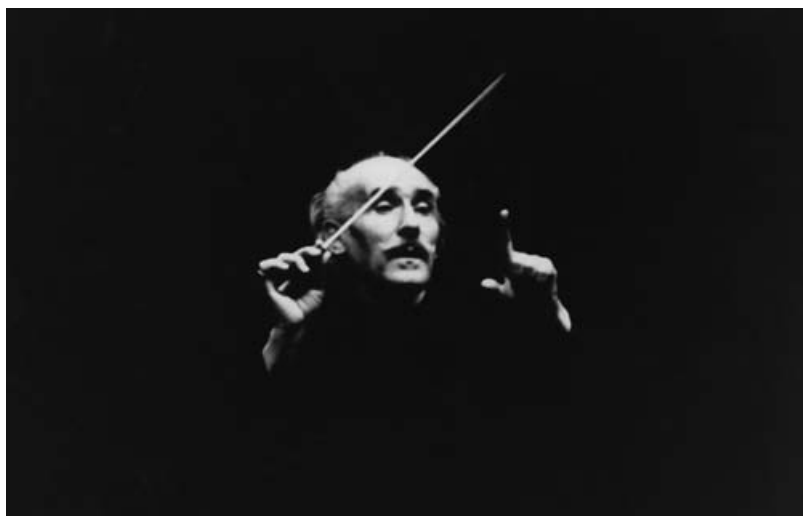
Arturo Toscanini.

In some of these images it is as if the conductors themselves take on the appearance of imagined spirits, all but disembodied, with only their most salient features evident. Principal among these is the highly symbolic baton – itself possibly related subliminally to the wizard's wand in the collective mind of the audience – and the hands that are so prominent in the performance of the dance. The face is also important, since through it we register our impressions of the musical spirits controlled by or possessing the shaman (see Figures 1 and 2). Such images, emphasizing the ethereal darkness within which we imagine the conductor operates, strongly suggest him to be a liminal, disembodied, almost ghost-like figure, a figure, in fact, who may very well be caught between this world and another.