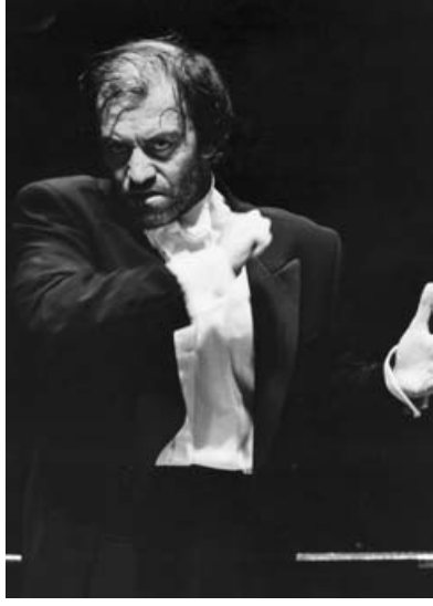
Figure 4 Valery Gergiev