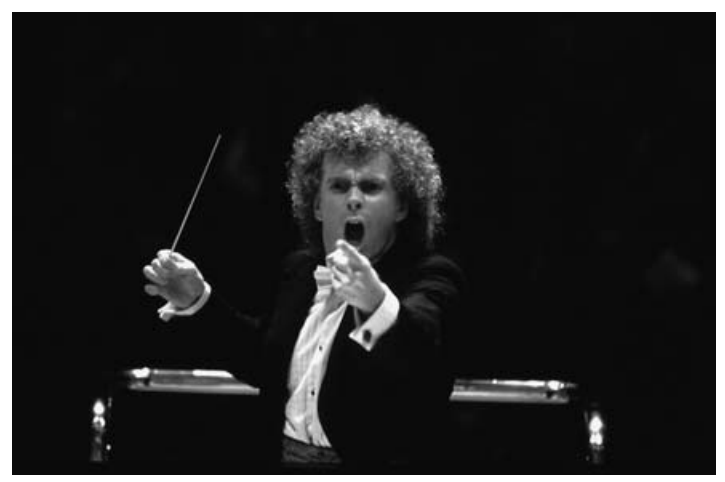
Figure 3 Simon Rattle.

In other images, however, the self-evident corporality of the conductor demonstrates something of the strenuous demands placed upon him as he dances. While the English word 'dancing' will for many bring with it associations of light-hearted pleasure, the conductor's execution of his task may lead to facial expressions and postures that could be read as conveying quite different meanings (see Figures 3–5). These images, ostensibly of passion perhaps but equally valid if taken as grimaces of pain, suggest the physical discomfort experienced by the shaman as he plays out the musical tensions that he takes symbolically into his body. The sweating brow and tousled hair remind us that this is hard physical work,