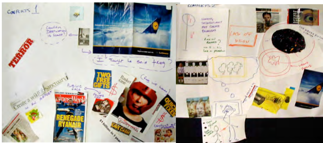
Figure 2. Aircraft conflict storyboards generated by the participants

We encouraged combinatorial creative thinking once many new ideas had been generated. Head of talent at toy manufacturer Lego provoked creative thinking by randomly introducing items into conflict resolution scenarios. Participants were divided into groups of 3, then asked to develop worst-case aircraft conflict scenarios. Every 10 minutes each group was given a new object at random (e.g. a toy frog, pair of binoculars, perfume or torch) to include in the scenario. The results were unusual scenarios represented as collages shown in Figure 2 and used during illumination to generate ideas about how CORA-2 would handle these conflicts.