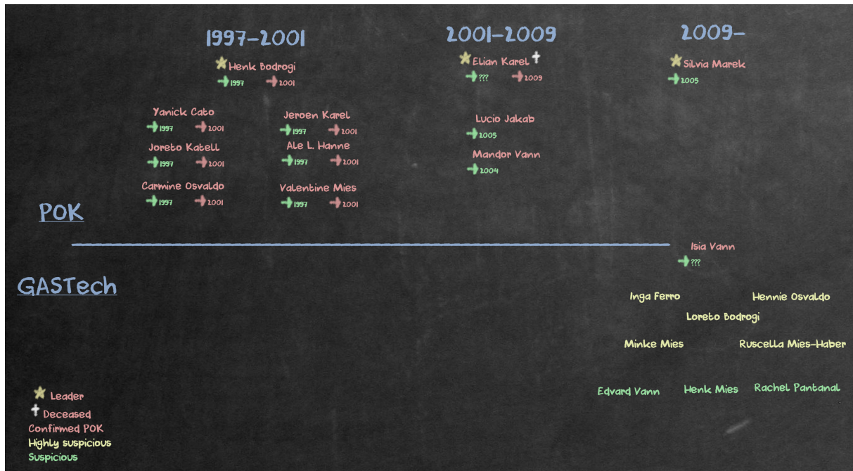
Fig. 1. Summary of the structure of a terrorist organisation using a chalkboard metaphor. Changes in membership and leader are shown above the horizontal line.