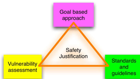
Figure 2: Safety Case triangle

The first approach is based on demonstrating compliance to a known standard—which is the approach that is normally used. The second approach is goal-based—where specific goals for the systems are supported by arguments and evidence at progressively more detailed levels. The final approach is a vulnerability-based argument, where it is demonstrated that potential vulnerabilities within a system do not constitute a problem—essentially a “bottom-up” approach as opposed to the “top-down” approach used in goal-based methods.