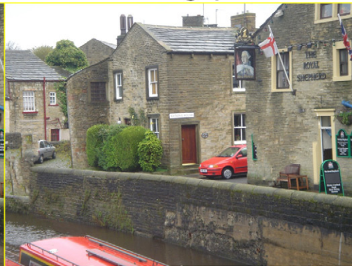
Figure 1. Images used in the forced-choice experiment.

example, if a patient said, “My vision is not blurred,” then this was not counted. The same analysis was conducted for words used to describe everyday activities used by participants as examples of when they were aware of their vision impairment.