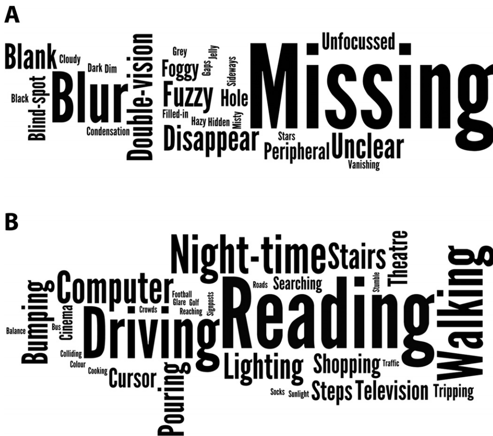
Figure 3. A , A word cloud ( www.wordle.net ; accessed July 1, 2012) showing the occurrence of descriptors of glaucomatous vision loss calculated as the number of participants who used the term. The size of a word in the visualization is proportional to the frequency of its use. B , A similar word cloud of named everyday activities where visual field loss was noted by an individual.

they are published. Providing realistic insights about patients' symptoms may be helpful for educational and public awareness material associated with glaucoma; the results from this report should be considered carefully in this context.