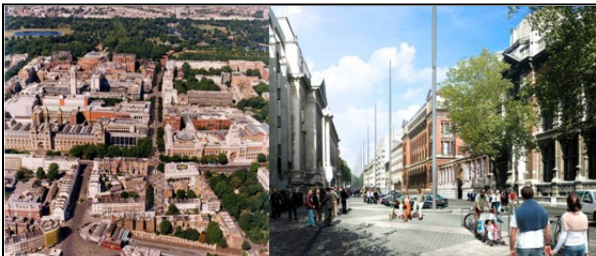
FIGURE 1 Impression of Exhibition Road post-implementation of the shared surface