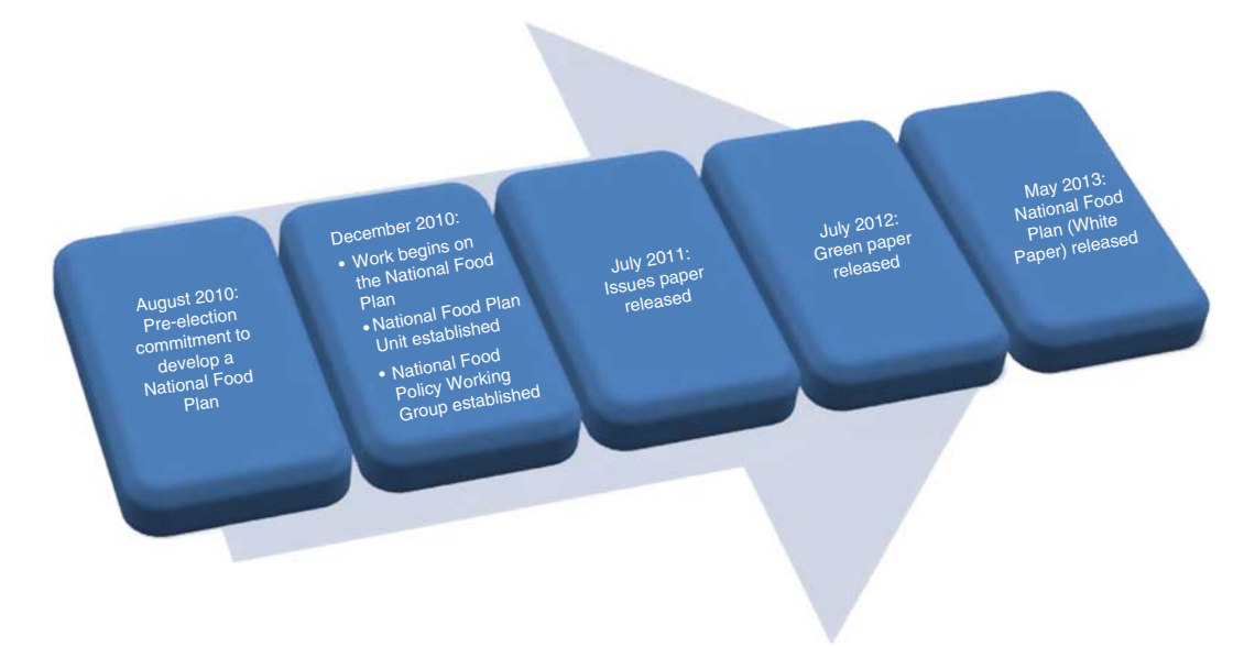
Fig. 1 Stages of development of Australia's National Food Plan from August 2010 to May 2013

developed and who was involved in its development (see Fig. 2). The policy triangle approach explores the role of actors informed by the context, process and content of policy development (21) and enables a generalized map of a policy area to be developed to aid systematic thinking<sup>(23)</sup>. This structure was used to organise and filter the documents gathered, first chronologically, then based on actors and stakeholder interests and positions. As Walt et al. (24) observe, policy analysis is a multidisciplinary approach 'that aims to explain the interaction between institutions, interests and ideas in the policy process' (p. 308). We would add that it is also multilevel in that interests and institutions operate at different levels in the policy world, from local to national. This is the case in Australia, which is a federation of states and independent territories with a parliamentary 'Westminster' system of government.