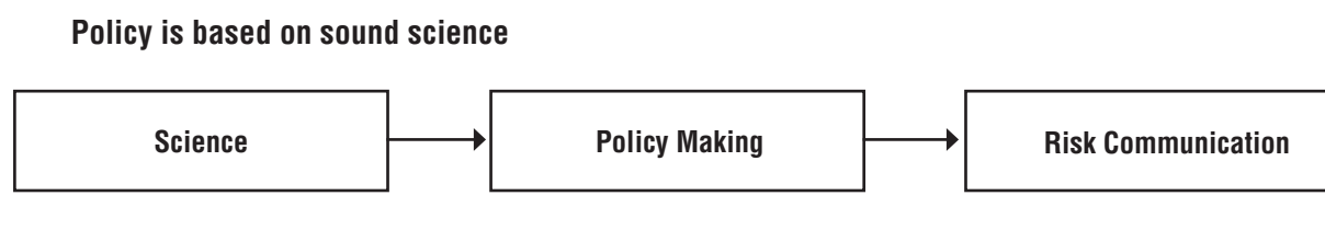
■ Figure I: The technocratic model

One classical account of science-based policy-making can be represented by what we term ‘the technocratic model’. It assumes that policy decisions about technological risks can and should be based on, and solely on, scientific considerations. Historically, regulatory policy-making for the protection of consumers and public health was often officially represented as if it were based on, and only on, ‘sound science’. The key characteristics of this classical ‘technocratic’ model are that it assumed, in effect, that science operates in complete independence of social, political, cultural and economic conditions, and