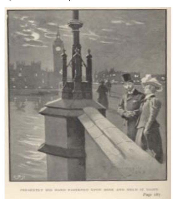
Figure 4: John Williamson's third illustration: the romantic element against the Westminster backdrop (author's private collection).