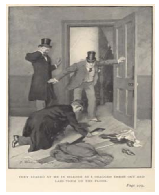
Figure 5: John Williamson's fourth illustration: the detective element.

Working With English: Medieval and Modern Language, Literature and Drama 2.1: Literary Fads and Fashions (2006): pp. 89-100