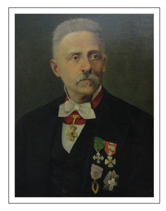
Figure 1. Reproduction of an oil painting of Ragona-Scinà (Chinnici, 2013).

with multi-field tachistoscopes. These were popular in vision research from about 1910 to about the 1970s when they were largely supplanted by oscilloscopes and then computer monitors (Wade & Heller, 1997).