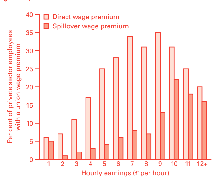
Figure 1 Variation of the extent of the direct and indirect impact of effective union bargaining in the private sector, by hourly earnings level, 1998

Source: WERS 1998; employees in private sector workplaces with ten or more employees. Note: Effective union bargaining is measured by the presence of multiple recognised unions or between 70 and 99 per cent of employees at the workplace being covered by union bargaining.