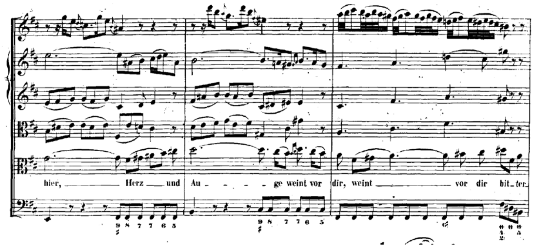
Johann Sebastian Bach, from 'Erbarme dich', in Matthäus-Passion.

This appears clearly around half-way through the piece, combined with music derived from that for a Bulgarian Folk Dance, Païdushka (a type of 'limping dance'). Otherwise, the piece employs Finnissy's characteristic close-packed, highly-chromatic writing, mostly in the lower treble area, and strident lines in single pitches and chords, over a narrow tessitura, all inflected by the employment of Tutev-related material.