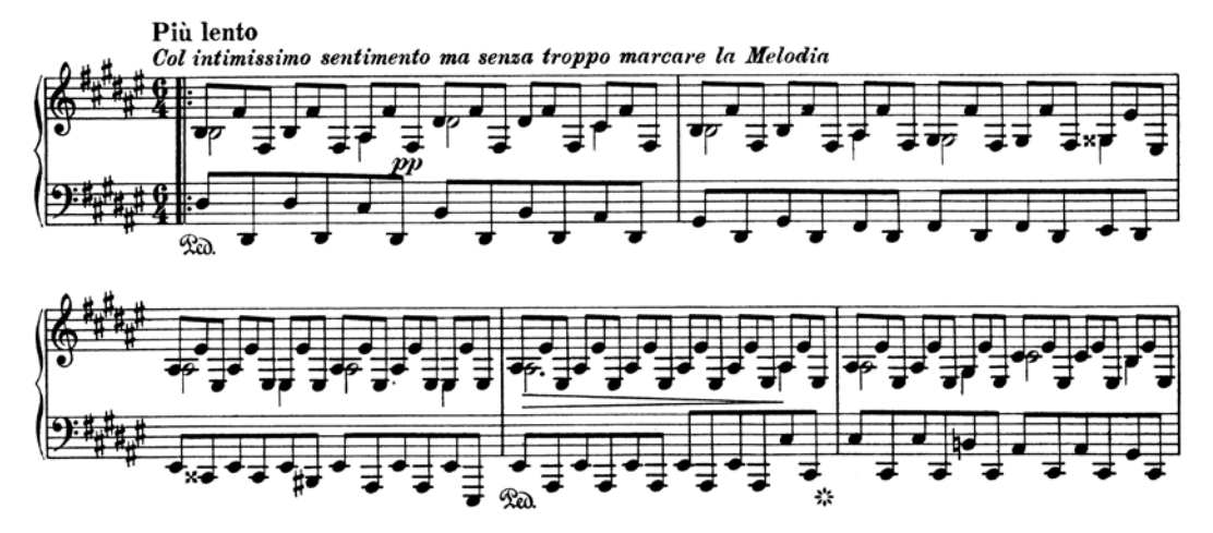
Johannes Brahms, from Ballade , op. 10. No. 4.

The other three songs are more oblique in their relationship to the Brahms originals. The second features a discursive structure, between light scherzoso material in a moderately transparent setting, and some more close-packed sostenuto writing, culminating in a series of inverted fragments from Brahms's No. 35, 'Soll sich der Mond nicht heller scheinen'. The racuous third piece uses Brahms's characteristic setting of a melody in sixths, fifths and thirds, as found in the piano parts of No. 31, 'Dort in den Weiden steht ein Haus', and No. 33, 'Och Moder, ich well en Ding han'. The fourth setting relates to Brahms's No. 29, 'Es war ein Markgraf überm Rhein', with the melody appearing in the tenor line. As in all of the songs, however, the material (in all parts) is in a continual state of flux, as Brahms's type of 'developing variation' is reconfigured in a much late post-tonal context.