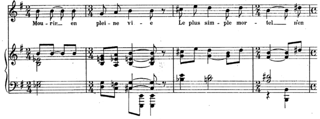
Erik Satie, 'Air de Geneviève' from Geneviève de Brabant, Act 2.