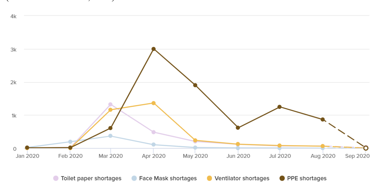
Figure 1. The number of news articles published about shortages.

Shortages of essential products stoked public fear and anxiety during the crisis, especially in the United States. According to the media database provided by Muckrack.com ( Figure 1 ), the number of articles issue of shortages of toilet paper and face masks peaked in March, while news coverage over PPE (face masks, N95 masks, medical gowns, etc.) and ventilators peaked in April. However, the media discussion of PPE shortages in the US continued even in late August (Bender and Ballhaus, 2020).