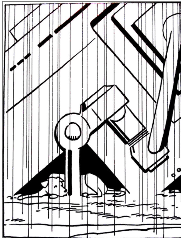
Figure 1: Hernandez, Jaime (w,p,i). Panel from Love and Rockets #48. 1995: 4:6. Seattle: Fantagraphics, Aug. 1995. © 1995 Jaime Hernandez.

Consider the panel below from Love and Rockets by Jaime Hernandez ( Figure 1 ). Hernandez has publicly acknowledged Stan Lee’s and Steve Ditko’s influence on his