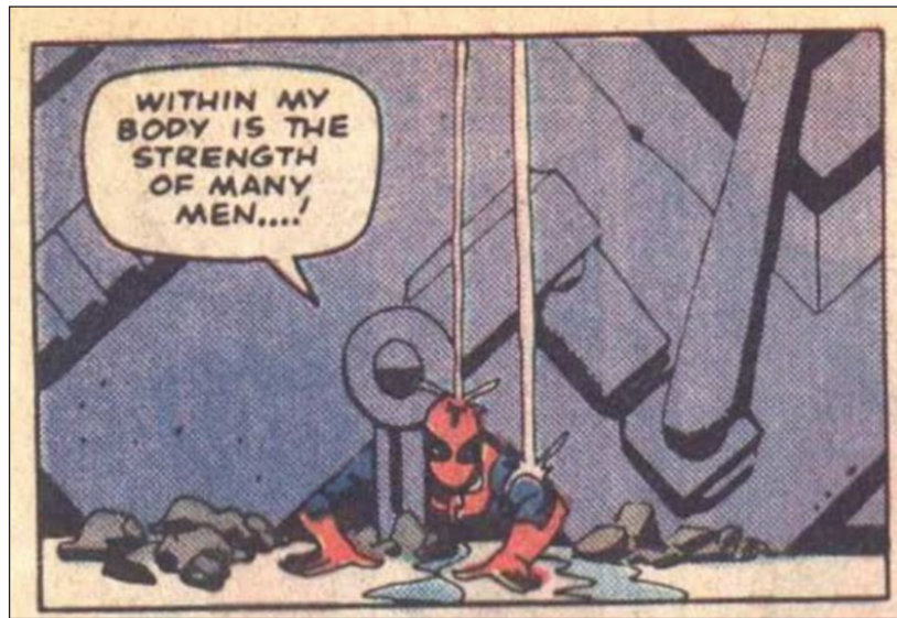
Figure 2: Lee, Stan (w) and Ditko, Steve (p). Panel from Amazing Spider-Man #33. 1966: 3:1. New York: Marvel Comics, Feb. 1966. © Marvel Entertainment Group, Inc.

work (Hignite 2010). In this example we can see how isolated elements are also present in a panel by Ditko ( Figure 2 ): the rain/water falling; the background/machinery have been recreated with noticeable modifications while making the reference detectable.