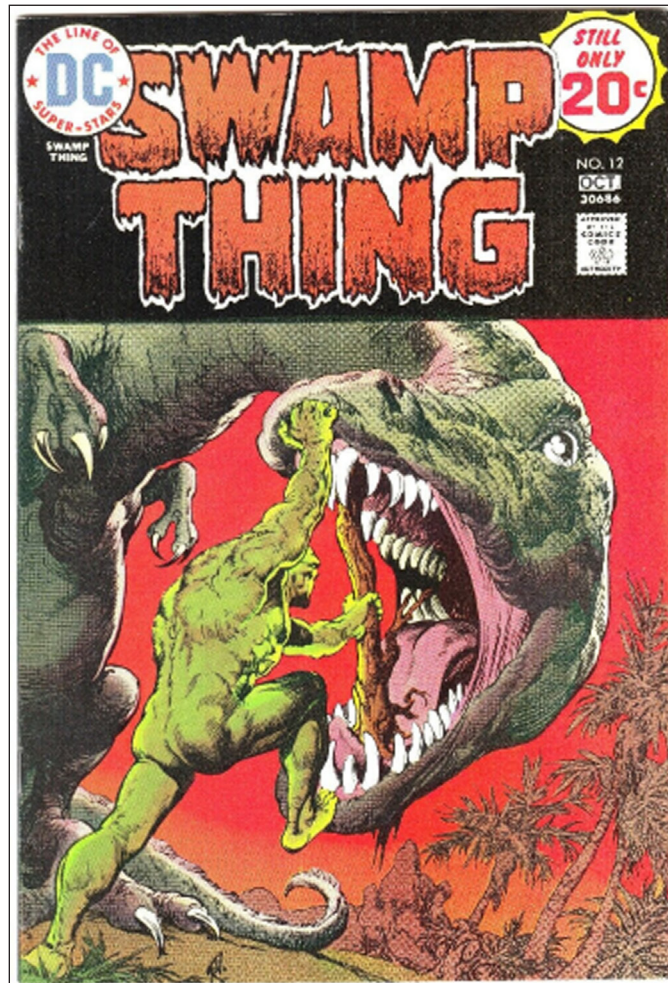
Figure 4: Wein, Len (w) and Redondo, Nestor (p). Cover of Swamp Thing #12. 1974. New York: DC Comics, Oct. 1974. © DC Comics.