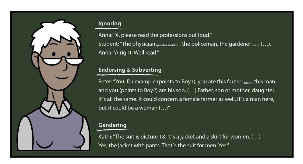
Figure 3: Examples of teacher talk: ignoring, endorsing/subverting and gendering texts

The first and most frequent 'talk' was ignoring gender-biased texts. Figure 3 exemplifies this talk in the discussion of a textbook text about professions, where descriptions and pictures of each profession were shown. Note that, unlike English speakers, that employ more gender neutral than gendered terminology, Dutch speakers employ both gender neutral (e.g. ingenieur , engineer[gender neutral]), male (e.g. tuinman , gardener[male]) and female (e.g. secretaresse , secretary[female]) professional terms (Hellinger, 2001; Gerritsen, 2002). Even though the distinction between Dutch gender neutral and male terms is not always clear-cut, female terms are clearly identifiable through suffixes such as -e , -ing , -ster , -es or -trice . The textbook text contained more male (seven) than female (three) professions. Both male professions (e.g. politieman , policeman[male]) and female professions ( verkoopster , saleswoman[female]), could be classified as low-status professions (Koster, 2020). Considering the limited amount of female terms, all of them low-status professions, we categorized the text as gender-biased. Figure 3 shows how teacher Anna (a pseudonym) ignores this biased depiction of gender roles in interaction with a student, as she simply asks the student to read the professions out loud and takes no further (verbal) actions.