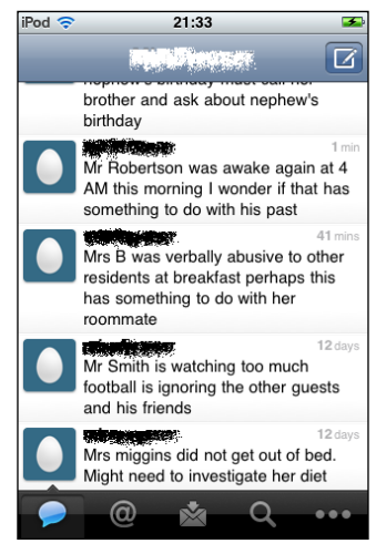
Figure 1. The use of Twitter to document reflective observations (on the lefthand side) and access to previous reflections (on the right-hand side)