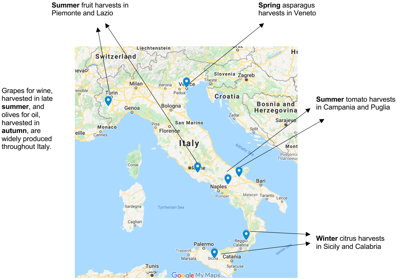
Figure 1: Map of Italian horticultural harvests throughout year.