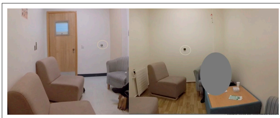
Figure 2. Camera 1 and camera 2 positions in the ED consultation room (cameras circled).