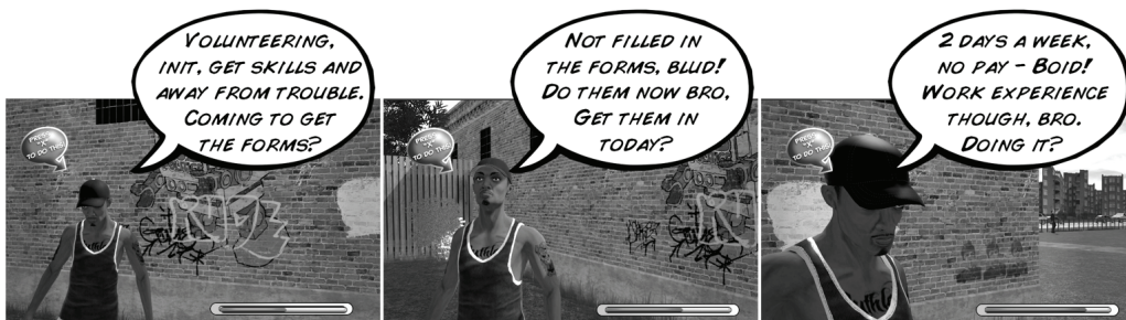
Fig. 3 Screen shots and abbreviated snippets from the spoken dialogue in StreetWise demonstrate how a story path with a particular character may develop over 3 rounds depending on the choices the player makes and random seeding from the Scenario Engine.

The scenario engine introduced a level of randomness to each game by seeding from a bank of interweaving scenarios and attributing them to suitable characters. It also reacted to how well the player was doing by utilizing weighted scenarios to provide easier or harder gameplay [fig. 4] – choices that were previously rejected were