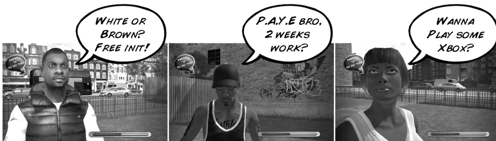
Fig. 2 Screen shots and abbreviated snippets from the spoken dialogue in StreetWise demonstrate 3 types of choices that may be presented to the player in round 1. Left to right the panels represent choice scenarios of, high-risk, low-risk, and medium-risk.