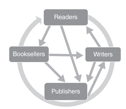
FIGURE 13.4 We all exist within a quantum state of bookishness.

an author. Many of us are writers by night, editors by day, and readers on our morning commutes. Critics by dusk and literary agents by dawn.