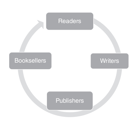
FIGURE 13.3 A basic reading ecosystem.