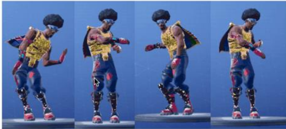
Figure 3: Fortnite Emote 'Swipe It' 26

The Milly Rock involves approximately four steps. (1) The performer's hand rises whilst the other hand is down. (2) This is then swung across the body while the knee is lifted. (3) It is then performed on the opposite side of the body. (4) This is repeated a few times. Fortnite has then created this: