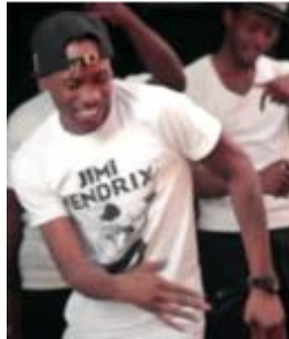
Figure 1: 2Milly performing the Milly Rock 24

In 2014, 2Milly popularised "Milly Rock" 23 as illustrated below: