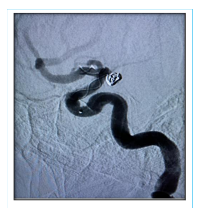
Plate 3: Digital subtraction angiography images demonstrating wide-neck saccular aneurysm of the posterior communicating artery post stent assisted coiling (x 2 magnification)

A 71-year old woman was referred to our institution on a clinical suspicion of left internal carotid artery stenosis on ultrasound examination. She is a known hypertensive for 4 years on medication. She had no history of stroke or transient ischaemic attack. Physical examination was unremarkable. Muscle power was 5/5 in all limbs. Digital subtraction angiography showed an incidental 4.8 x 3.7 mm saccular aneurysm of the right posterior communicating artery with normal caliber internal carotid artery bilaterally with no stenosis. Under general anaesthesia and using Seldinger technique, 7F vascular sheath was sited in the right common femoral artery and a 7F enjoy guide catheter navigated into the right internal carotid artery. The aneurysm was cannulated with a