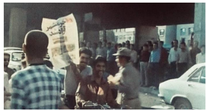
(Figure 2: People celebrating the liberation of Khorramshahr outside Tehran's Hotel International).