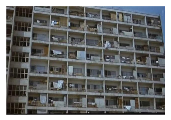
(Figure 3: Hotel International in the 1980s)

After the war ended in 1988, the hotel continued to house refugees, but there was increasing pressure to repurpose the building, and the last residents left in 1993.