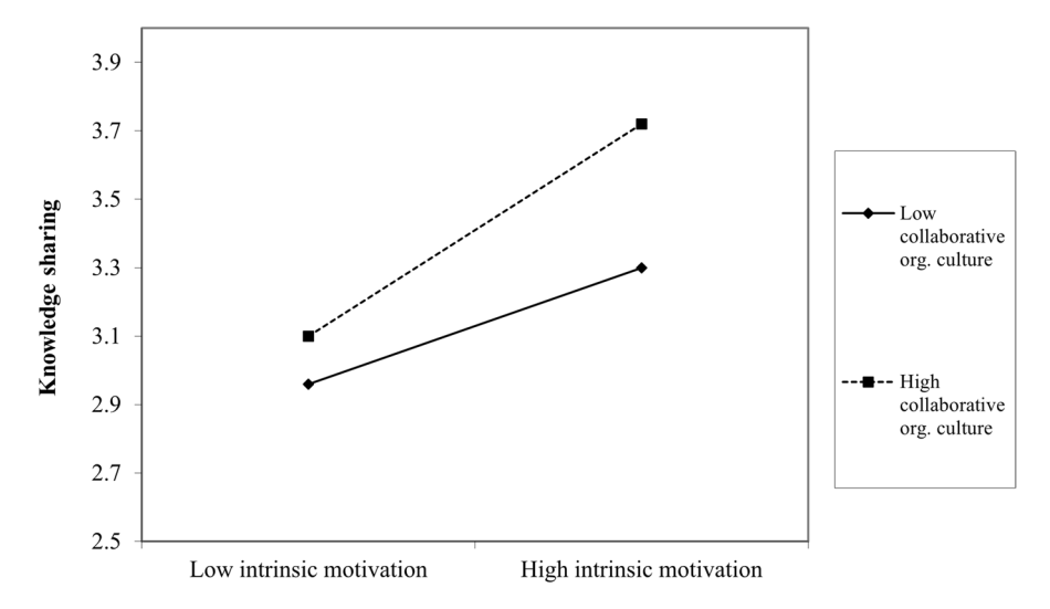
Fig. 2 Collaborative organizational culture moderating the relationship between intrinsic motivation and knowledge sharing