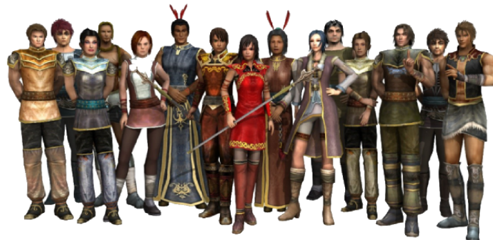
Figure 1. Rainbow SPARX (Smart, Positive, Active, Realistic, X-factor thoughts) characters (the female character dressed in red holding a staff and the male character immediately beside her are the avatars).

Perhaps unsurprisingly then, when SGMY reviewing Rainbow SPARX (in its original format) in 2017 in the United Kingdom were asked if they would use the intervention if they were feeling down , only 38% (8/21) of participants indicated that they would do so [33]. This was among a sample for an exploratory qualitative study where 86% (18/21) of participants reported that they had felt down or low in the past (ie, they were ideally placed to assess an intervention for mild to moderate depression in SGMY) [33]. Given this feedback, we have decided that our new toolkit will not be an adaptation of an existing mainstream program such as SPARX, but instead it will be entirely rainbow in its focus. The PRIDE toolkit will be designed together with SGMY at the forefront, in an overdue effort to meaningfully center those who have been marginalized in terms of their mental health needs. Rainbow SPARX was designed with SGMY in New Zealand and is a fantasy-based serious game. However, consultation sessions with SGMY in