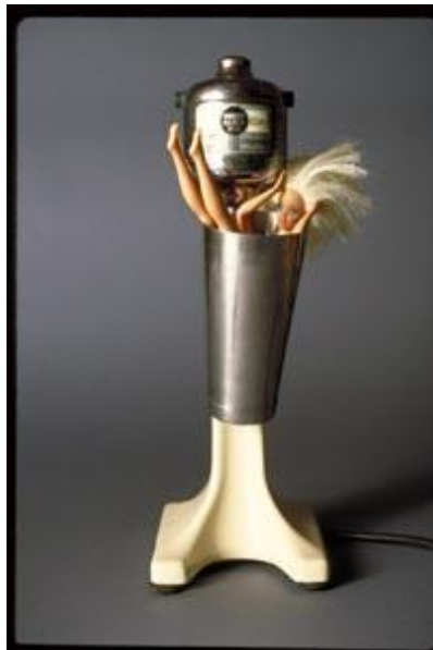
Figure 7. Food Chain Barbies

Forsythe argued that the series critiques the idea of “perfection” and how women are supposed to look and act. Mattel Inc., the producers of Barbie dolls, sued Forsythe for both copyright and trademark infringement.