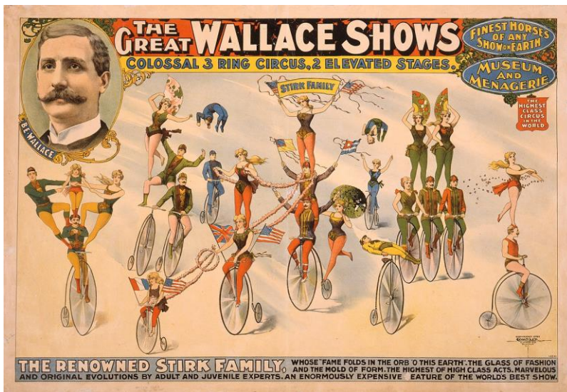
Figure 4. Bleistein Circus Posters

In the late twentieth century, the Supreme Court doubled down on the originality doctrine in Feist Publications v Rural Telephone Service . 216 That case concerned the copyrightability of telephone directories. 217 The court held that while mere facts, like telephone numbers, cannot be protected, the compilation of such facts can be protected providing that such writings are “original.” 218 Dismissing the “sweat of the brow” standard of originality, the court concluded that if a writing is not copied and contains a “modicum of creativity,” then that copyrightable subject matter will be protected by copyright. 219 Somewhat unhelpfully, the Supreme Court did not clarify their understanding of “creativity”. This contrasts with European jurisprudence which understands creativity, much like Holmes did, in terms of personality. 220 What makes a work creative and thus original? The “free and creative choices” of the author through which the author’s personality is stamped on the page. 221