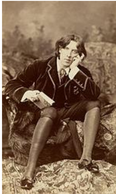
Figure 1. Sarony's Oscar Wilde No. 18.

Fast forward to one of the twentieth centuries greatest copyright debates: the protection of software. Software is a set of instructions which direct computer hardware to perform tasks. Broadly, software can be separated into human-readable source code, and machine-readable object code. Source code is written by humans in various “plain text” languages, such as C, C++, Java, or Python (see Figure 2). Once the source code is complete, a language translator converts the code into machine-readable object code. Object code is written in binary (see Figure 3). The hardware's central processing unit understands object code and executes the instructions contained therein.