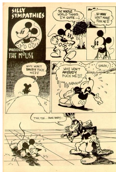
Figure 5. Air Pirate Funnies

Walt Disney sued the Air Pirates for copyright infringement. The Air Pirates responded that their comic was a criticism of American culture.