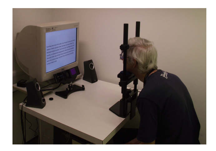
Fig. 2 The computer setup used during the reading experiment. The EyeLink 1000 eyetracking system was calibrated using the proprietary algorithm. A specified calibration accuracy of at least a "good" level (defined by the EyeLink software) was a prerequisite before each trial. Drift corrections were performed throughout experimental testing and, in cases where a large drift was detected, the subject was recalibrated before the study continued

The reading material consisted of eight short paragraphs of text (68–79 words per paragraph, 5–7 lines per paragraph), adapted from an English fiction book. Each paragraph was presented one at a time in random order at 100 % contrast