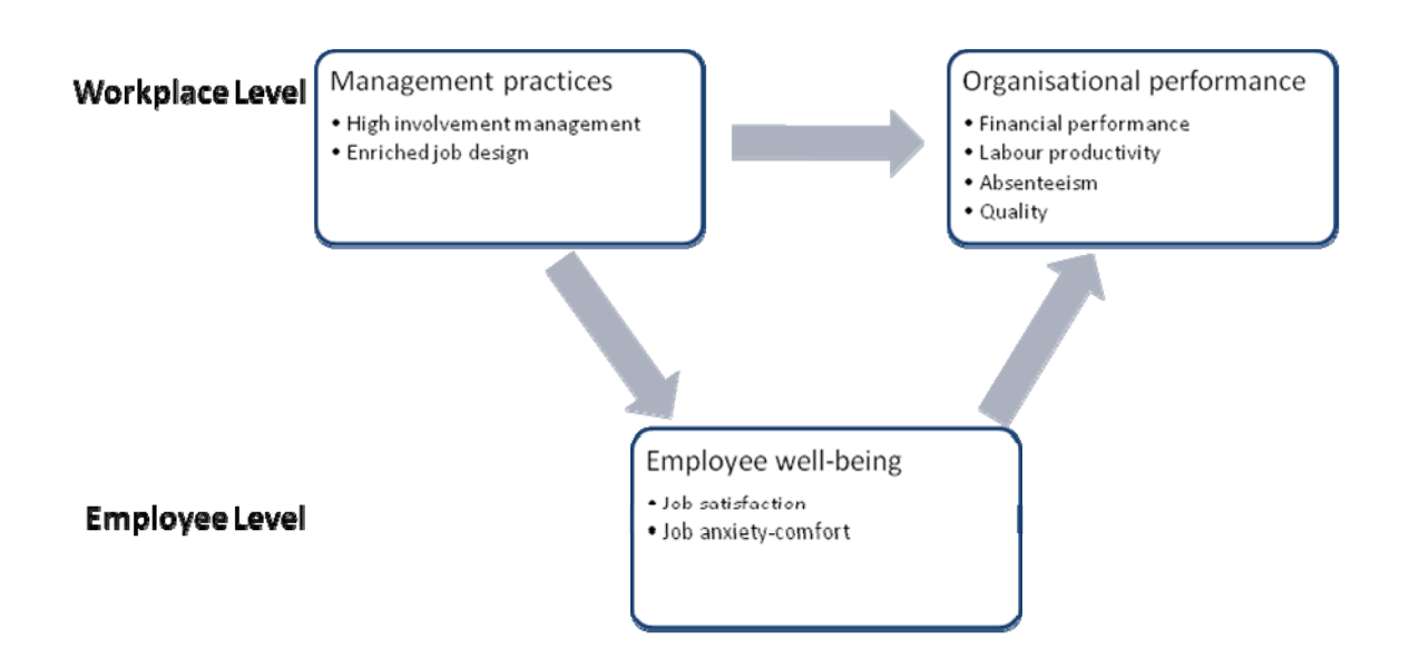
Figure 1 A multi-level model of well-being as a mediator of the management practices - performance relationship