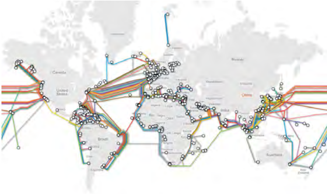
Figure 1: Global Submarine Cable Map.