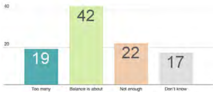
Figure 2: ‘Do you think the British security services (such as MI5) have too many powers to carry out surveillance on ordinary people in Britain, too few powers to carry out surveillance, or is the balance about right?’ (%)